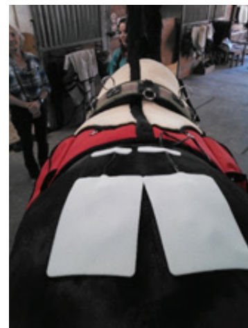
Figure 2: Image of a horse instrumented with the CURO system