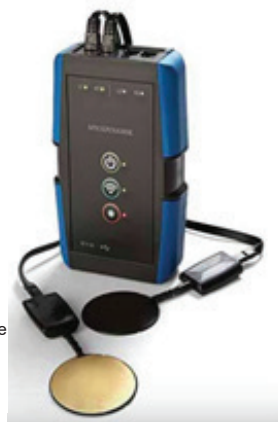
Figure 1: Image of the CURO system including specifications. Myodynamik Aps (Denmark)