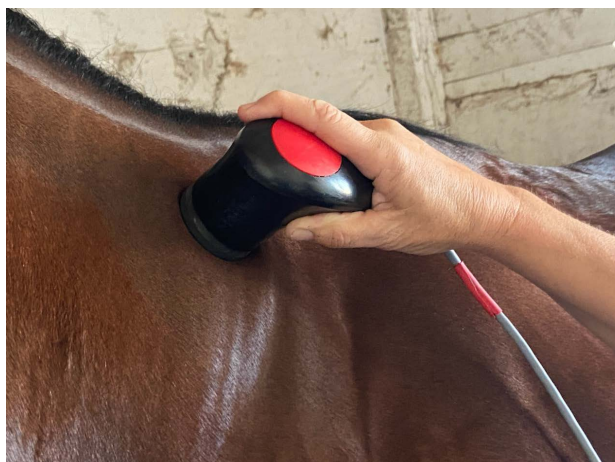
Figure 1. A photograph taken during treatment of the hand-held transducer of the type “RED” in place on the cervical region of the shoulder muscle trapezius.

EQ Pro therapy does not require horses to be sedated or treatment areas to be shaved, only that they are cleaned with water and left wet so as to facilitate the EQ Pro transduction. US-specific gel was applied to both the contact surface of the EQ Pro transducer and directly to the treatment area. This was done so as to further facilitate penetration, but also to assist the transducer head to smoothly glide over the treatment area. Subsequent applications of US gel were made when it was felt that insufficient gel was present at the treatment site. The power output was set to 80% - 100% and a treatment time of 10 minutes was used, with the transducer being constantly moved over the hair and skin surface, equivalent